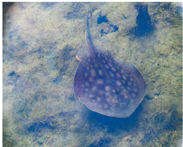
Kurt Bayless – Round Stingray