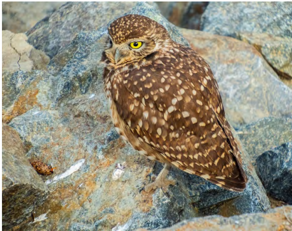
Kurt Bayless – Burrowing Owl