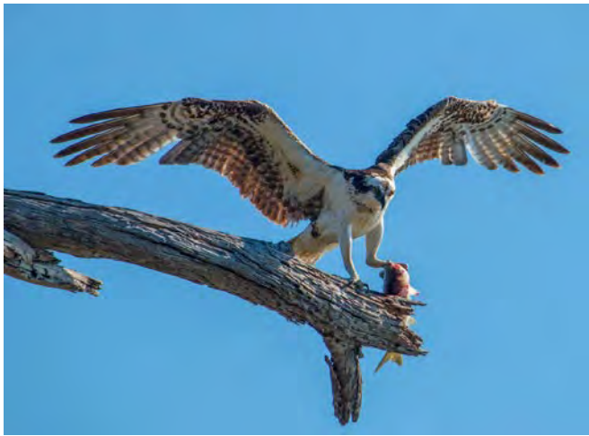
Osprey with fish