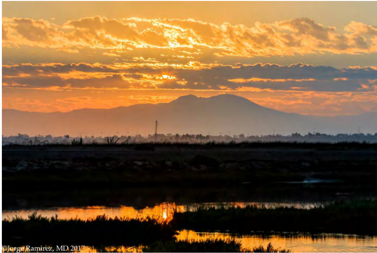
View of Saddleback Mtn. from Bolsa Chica wetlands