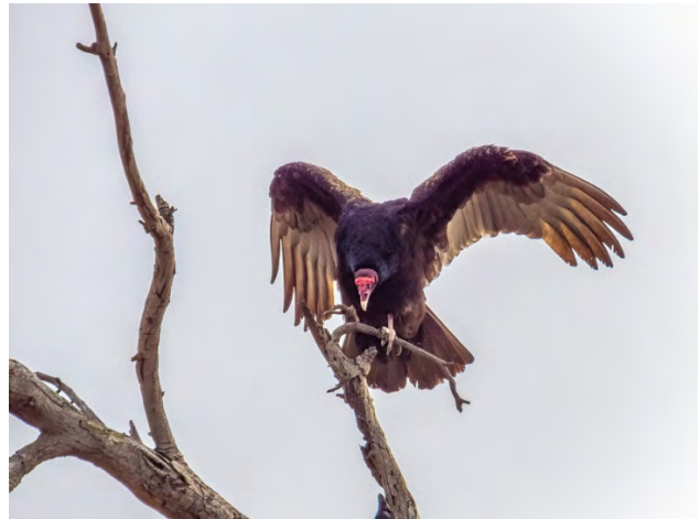
Kurt Bayless – Turkey Vulture