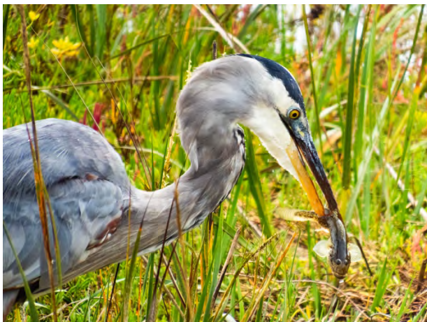
Kurt Bayless – Great Blue Heron with fish